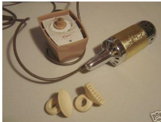
1960s Niagra Cyclo-Massage vibrator with attachments with speeds from 0-100! Shaped like today's silver bullets!