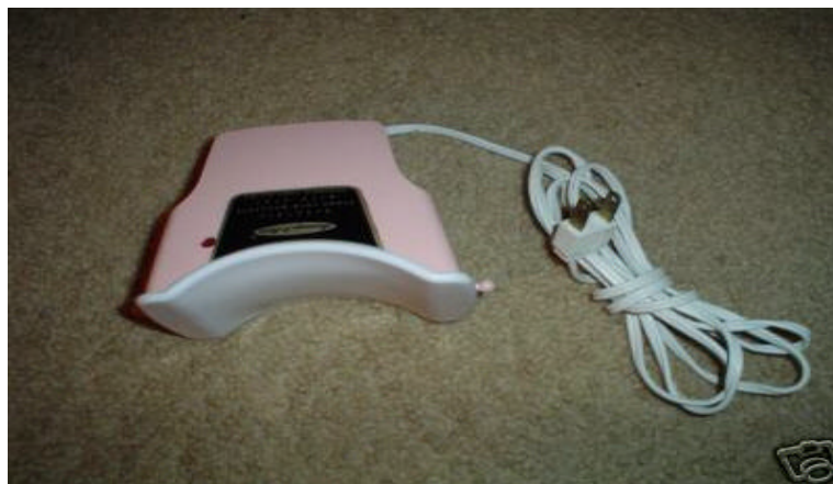
1960s Massage-O-Matic electric vibrating chin/neck massager with 2 speeds and heat, made by Songrand Corp. in Kansas City, MO.