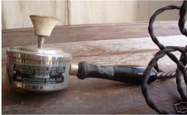
Star Electric Vibrator from Fitzgerald Manufacturing Company, dated 1920s.