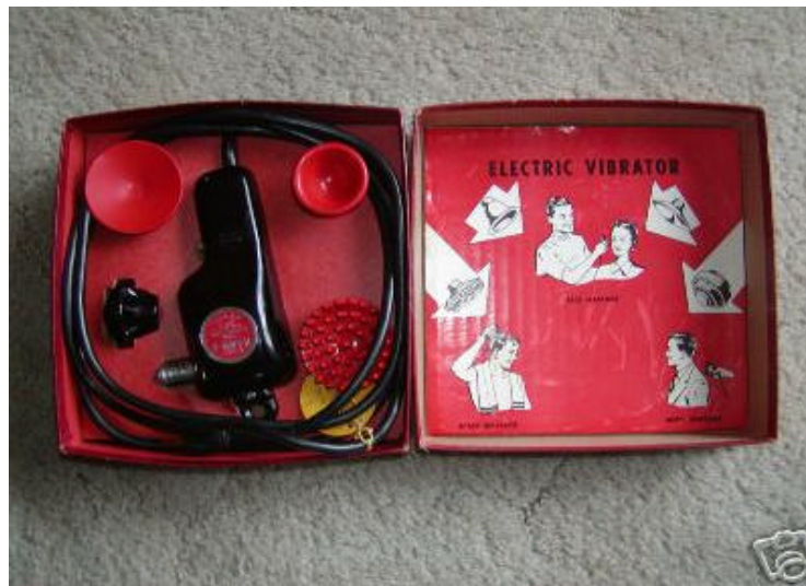
4 in 1 WAHL vibrator with 4 attachments. Dated 1950s