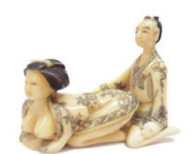
19 th century handcrafted ivory Chinese sculptures. Each man and woman are individual sculptures that you can separate ~ they are not “stuck together” so you can animate movements.