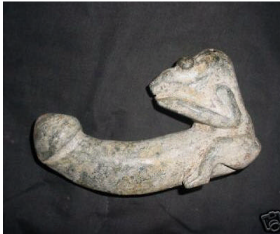
8" natural jade antique sex toy dated from around 1700.