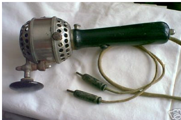
Standard Electric Company, dated 1902, with a power cord to plug into some sort of power supply. Looks like jumper cables!