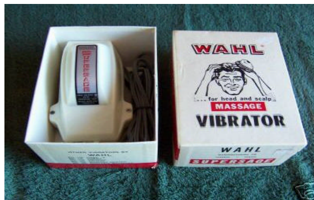
Wahl Body Massager / Vibrator, dating from 1957, Wahl Manufacturing Company, Toronto, Canada. This is another hand strap vibrator.