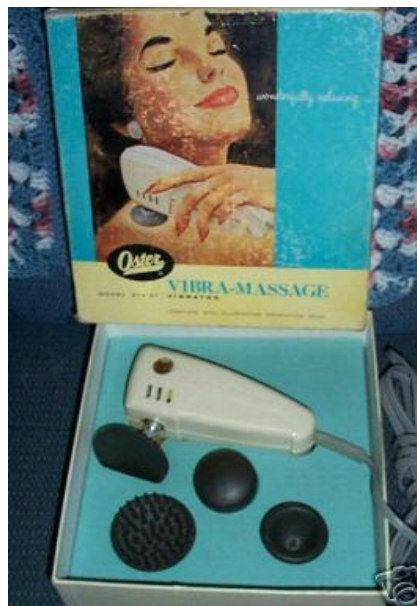
1960s Oster vibrator with 4 attachments. "Two Speeds Low intensity for scalp and facial, High intensity for body massage."