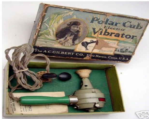
1920s Polar Cub vibrators with attachments. Check out the “flapper” on the cover!