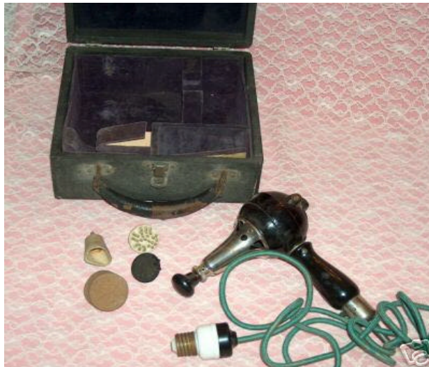
1900s Premier vibrator in a felt-lined wooden case with attachments. Did these toys plug into light sockets??