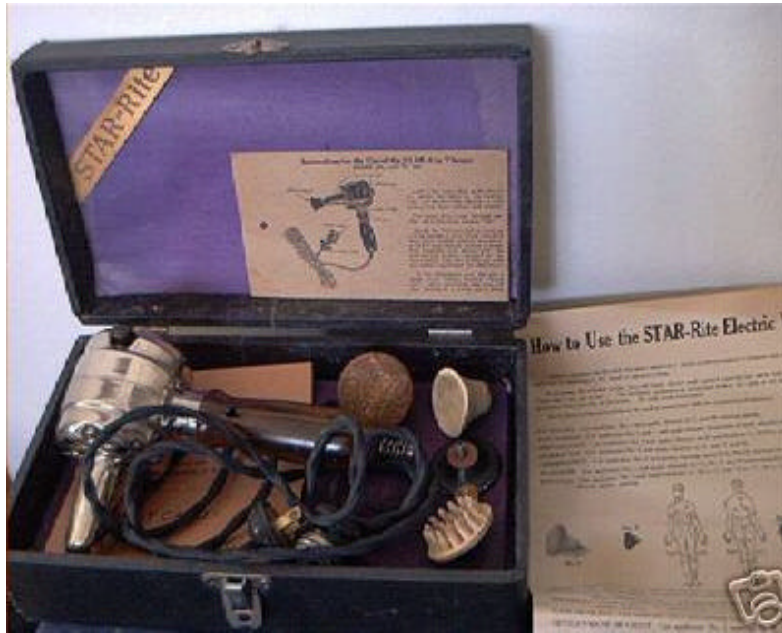
1940s STAR-Rite Electric Vibrator with attachments from the Fitzgerald Manufacturing Company in Torrington, CT. The instructions sheet that claims to treat such medical ailments as: Neuralgia, Rheumatism, Nervousness, Indigestion, Constipation, Headache, Insomnia, Obesity, Complexion, Double Chin, Wrinkles, Crow's Feet, Development of Chest, Reducing Hips, and Sore Muscles.