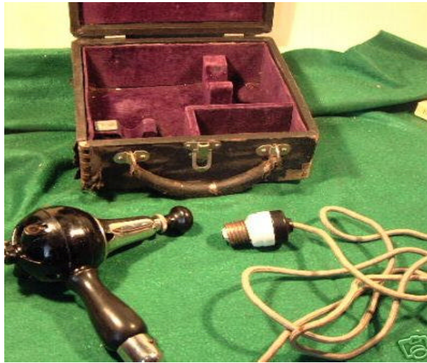
1900s vibrator with a felt-lined wooden case...check out the power plug!