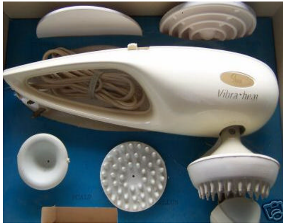
1970s Sears Vibra-Heat Model Vibrator with 6 attachments, featuring an on/off and heat switch!