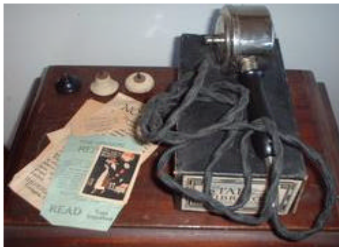
1920s Star Electric Vibrator from Fitzgerald Manufacturing Company, with attachments and instructions!