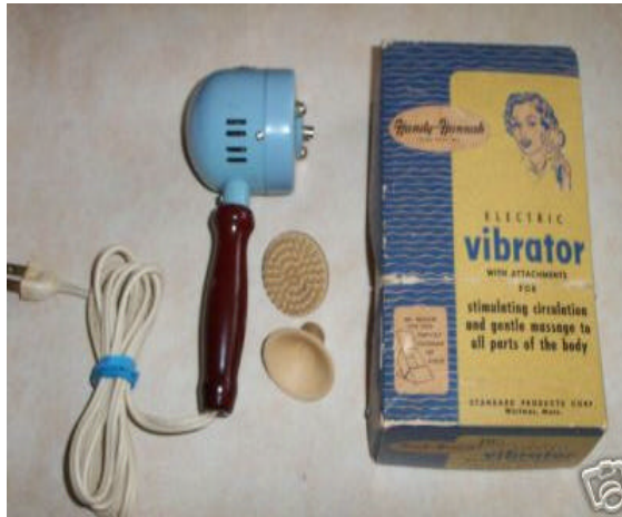
1950s Handy Hannah with original box and attachments.