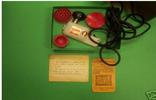
1960s vibrator with 3 attachments