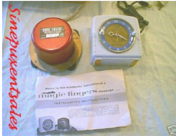
1960 Magic Fingers Bed Massager. This was placed in the middle of the box spring to make the bed vibrate!