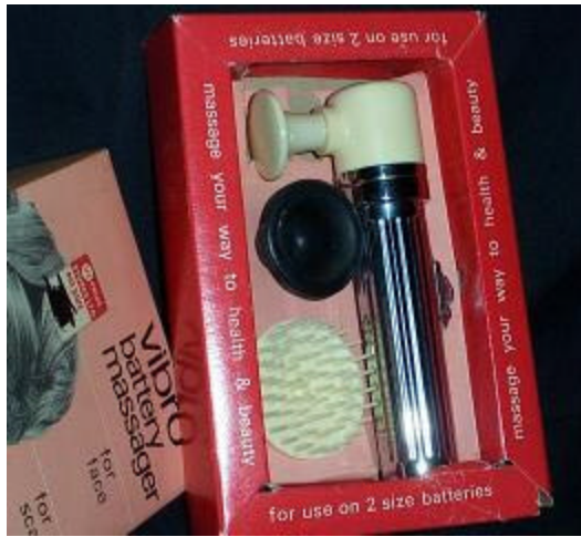
1970s Vibro battery massager/vibrator with 3 attachments for face, scalp and body. Uses 2 C batteries.