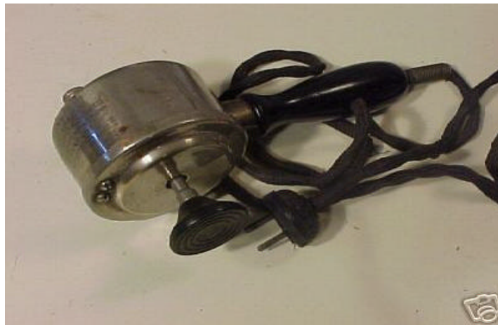
1920s vibrator from Fitzgerald Manufacturing Company.