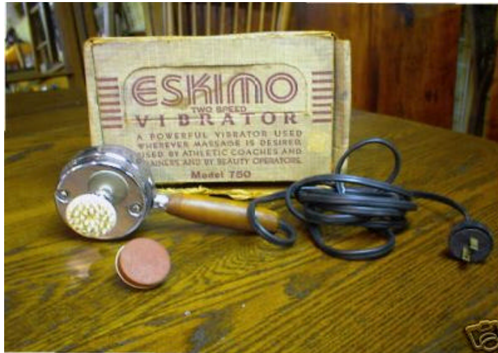
1950s Eskimo brand vibrator. Box states "A powerful vibrator used wherever massage is desired. Used by athletic coaches and trainers and by beauty operators."