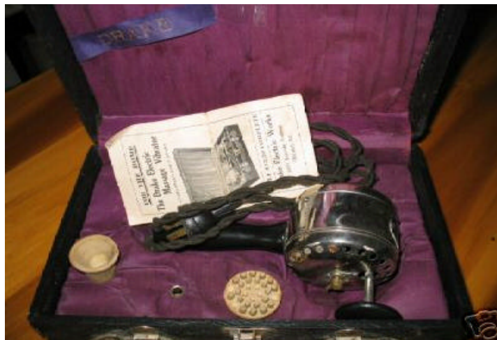
Drake Vibrator with attachments, purple satin lined box, dated from 1940s.