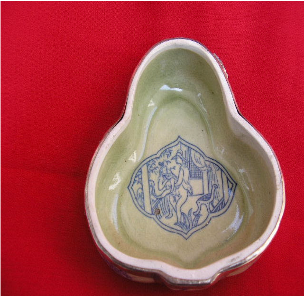
Under the cover. (I enlarged this picture to enhance the artwork.)