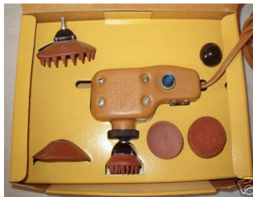
1950s Andis Vibrator with 6 attachments, advertised for massaging, circulation and stimulation on scalp, face, body and feet.