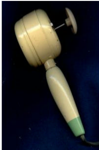
Kwik-Way 1930s electric vibrator