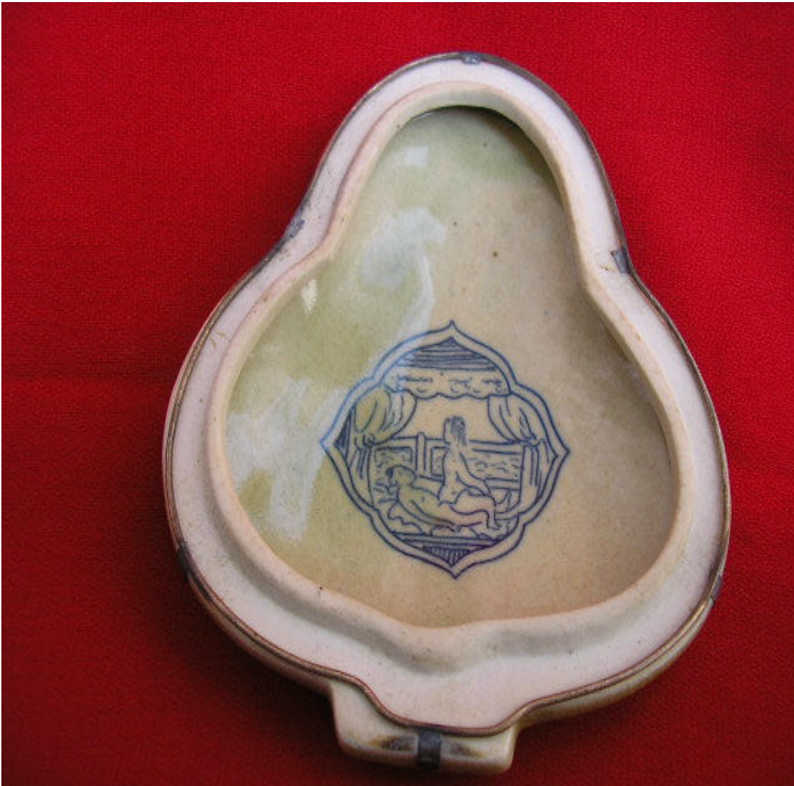
Under the base. (I enlarged this picture to enhance the artwork.)