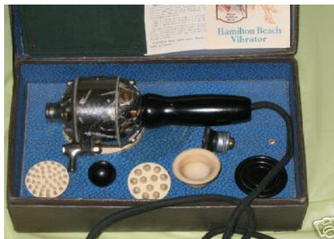
Hamilton Beach Vibrator dated 1927 with attachments