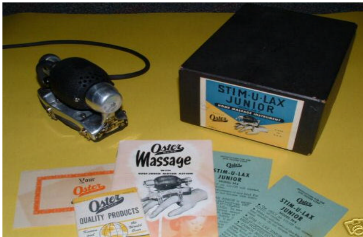
Hand strap Stim-U-Lax vibrator, dated from around 1933-1940. These types of vibrators would strap to your hand.